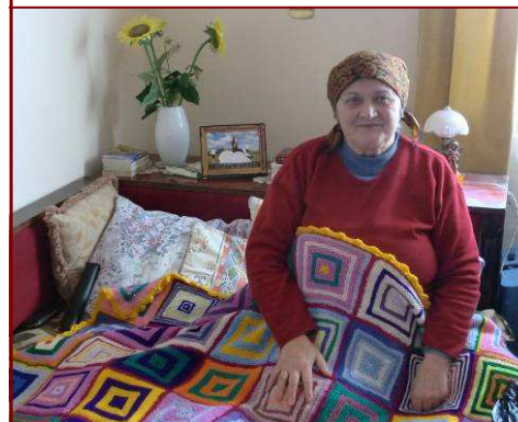
A knitted blanket brings a smile, and the opportunity to talk awhile.