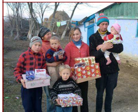
Christmas gift boxes are distributed to schools and needy families.