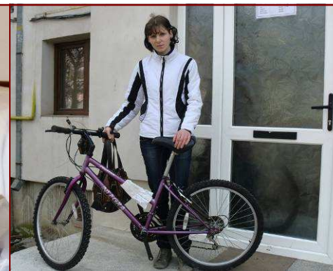
Bicycles, computers and other items find a new usefulness with local people.