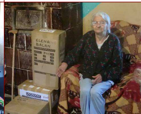
Designated boxes of clothing and food are delivered to their recipients.