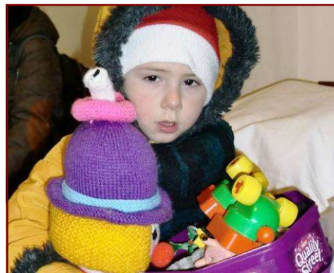
Clothing, food, toys and other essentials are donated to needy families.

Training is provided for staff and volunteers as opportunities arise..