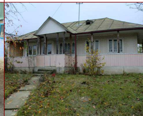
A new home brings a fresh start and new hope to a displaced family.